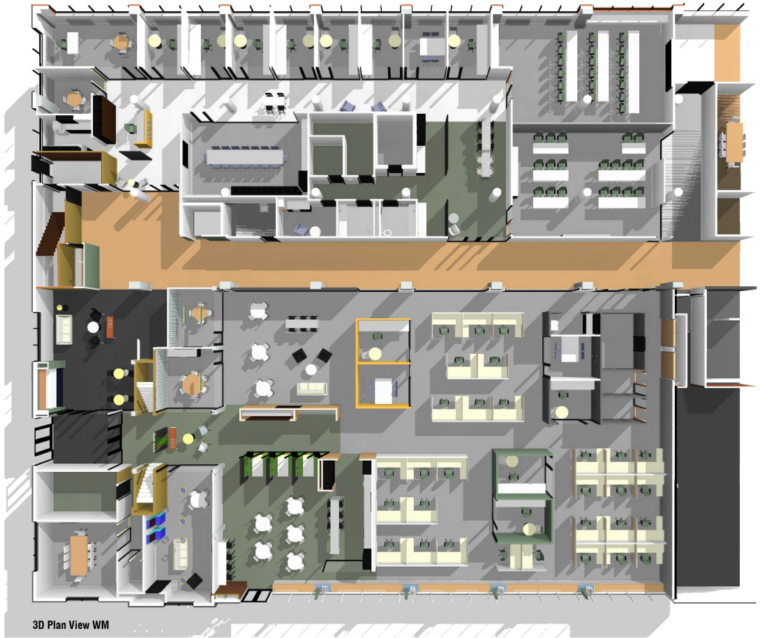
3D Plan View WM